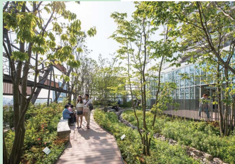
▲"Toshima Forest" roof garden.

Completed on the 10th floor is "Toshima Forest", a re-creation of nature of former Toshima city. It will be a space where the citizens of Toshima city can rest while studying natural system, such as Toshima city's vegetation and ecology. The Toshima Forest is linked to the "Green Terrace" on the fourth, sixth and eighth floors by use of the external staircase, thus a tour-for-study route for feeling ecology will be open.