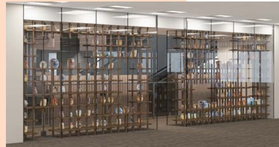
▲ Display case with many owls works (3F)

From the era of Edo, toy horned owls made of Japanese pampas grass, have been popular as local folk toys, and because of the good ring of "Hukurou", owl, to "Ikebukuro", the owl has been duplicated with the image of Toshima-city. Toshima city has a Japan's largest collection of 14,000 owl pieces. World's rare owls, incl. horned owls, such as varieties of owl ornaments and toys made out of stone, wood and glass will be shown.