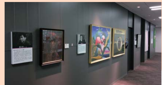
▲ Display space in elegant tone.