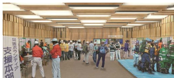
▲Image of Toshima center square in case of disaster.