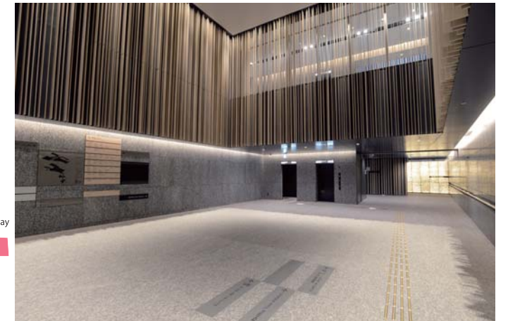
▲The lobby on the basement 2nd fl. links the city office to the underground passage.

Thanks to the underground passageway that leads to "Higashi-Ikebukuro station" of the Yurakucho Line, the new city office and the Sunshine building have been linked